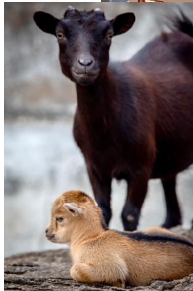
Goats from Kekeli's independent living program.