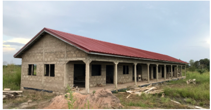
Construction of the Early Childhood Centre